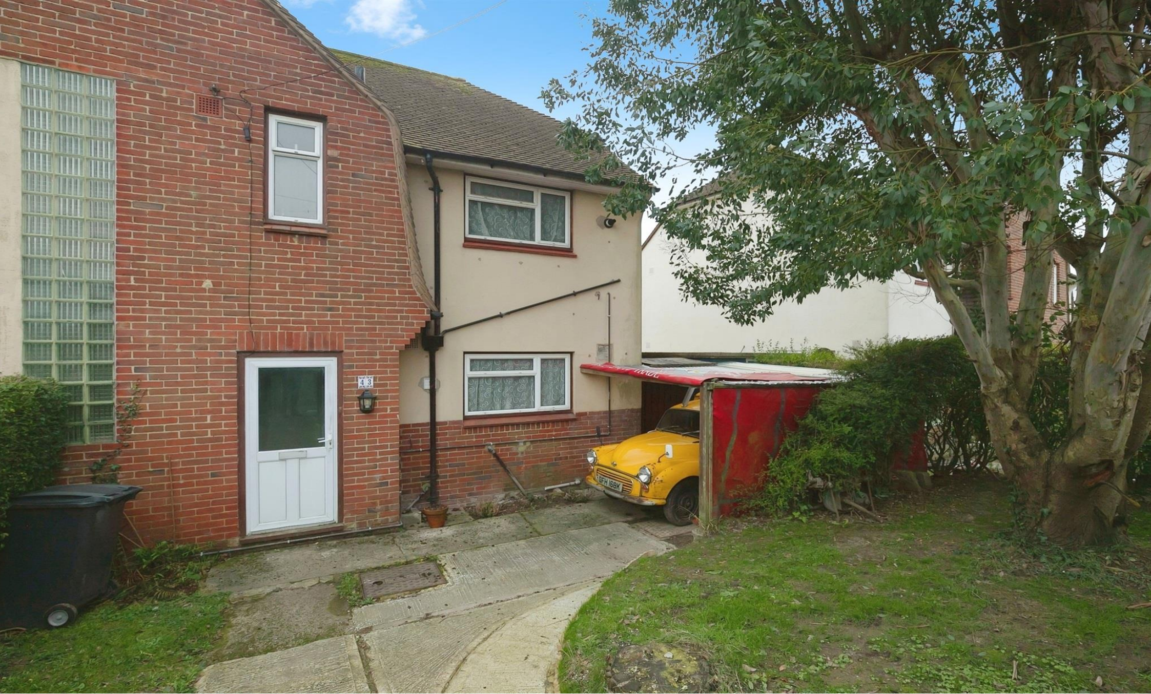
Lewis Road, St. Leonards-On-Sea TN38 9EP