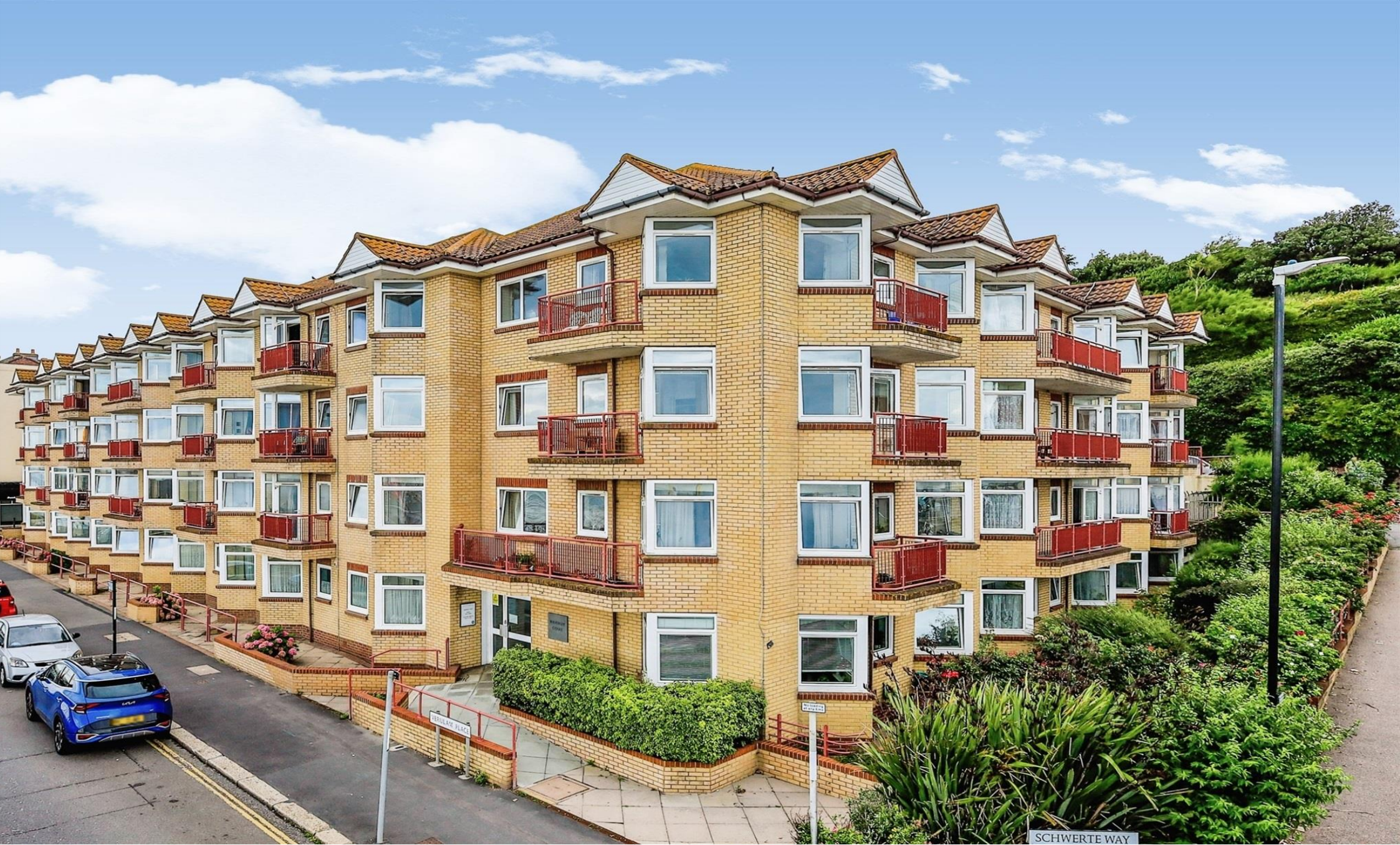
Waverley Court, St. Leonards-On-Sea TN37 6QR