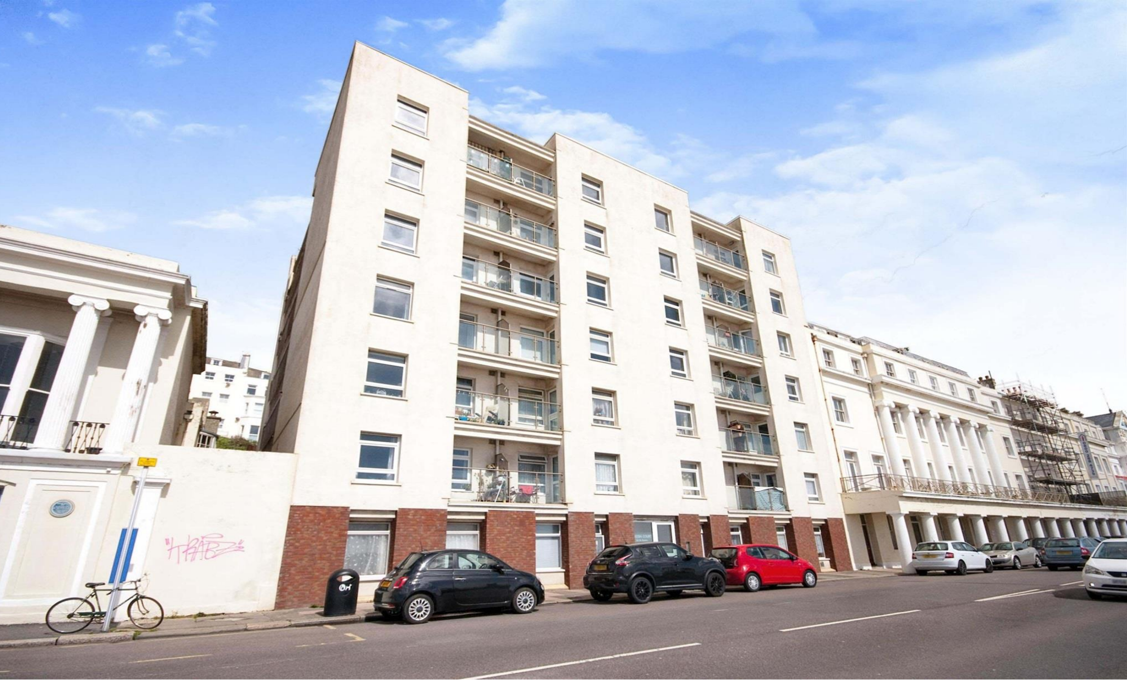
Greeba Court, St. Leonards-On-Sea TN38 0BQ