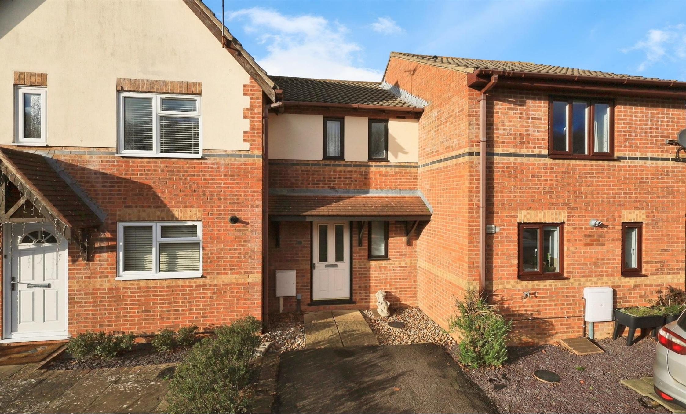
The Belfry, Hailsham BN27 3UG