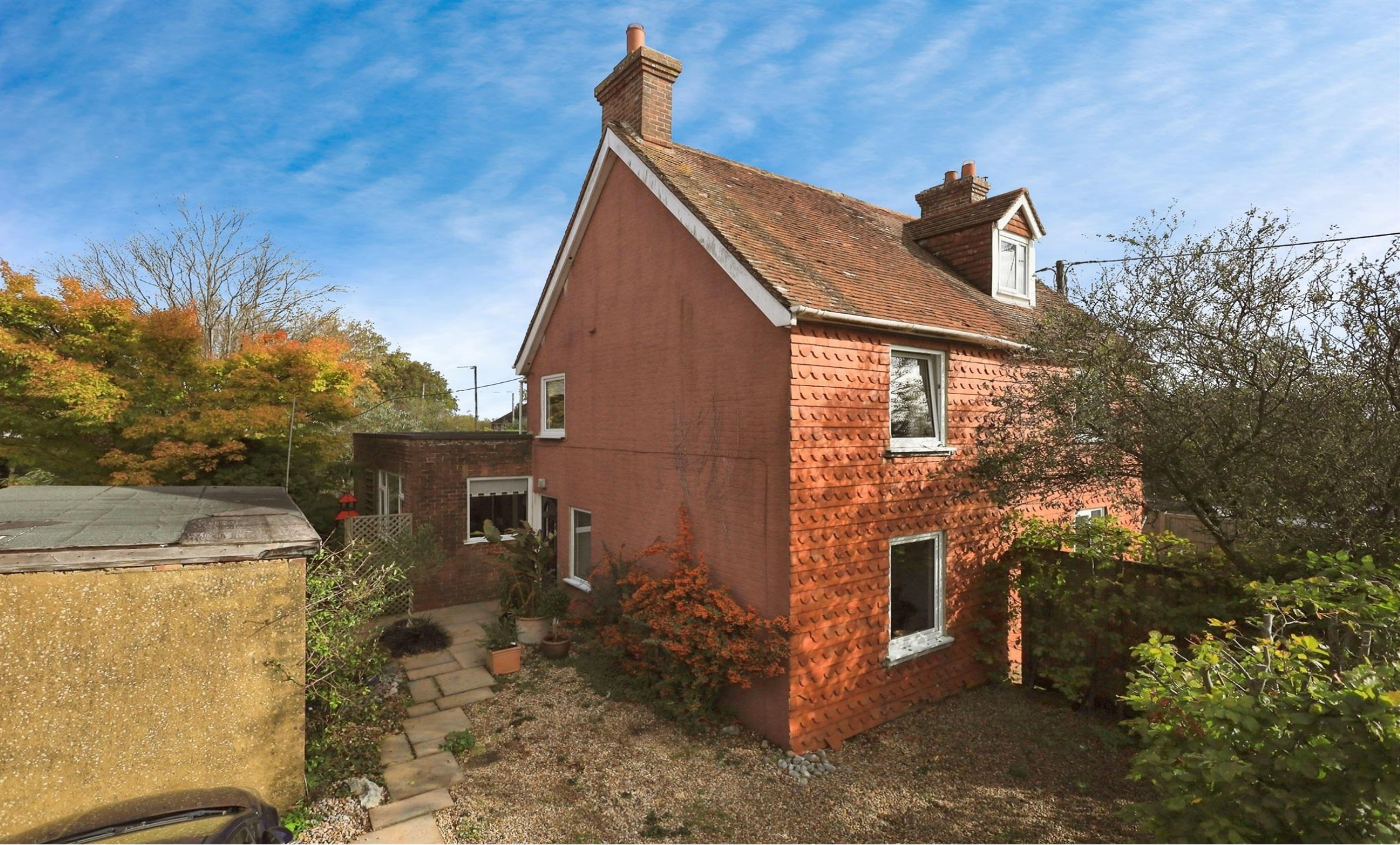
The Croft, Lower Dicker, Hailsham BN27 4BS