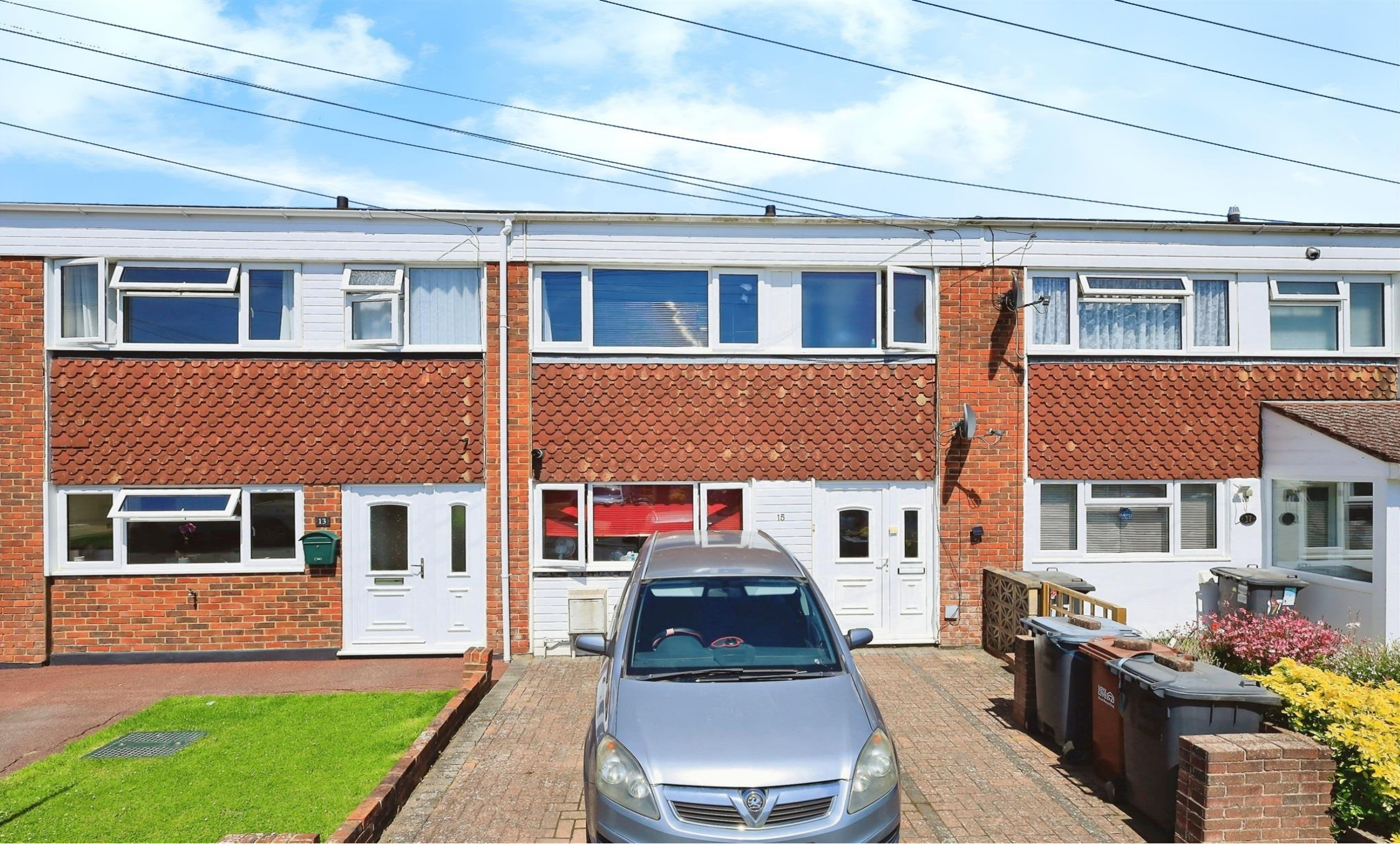
Sussex Close, Hailsham BN27 3EB