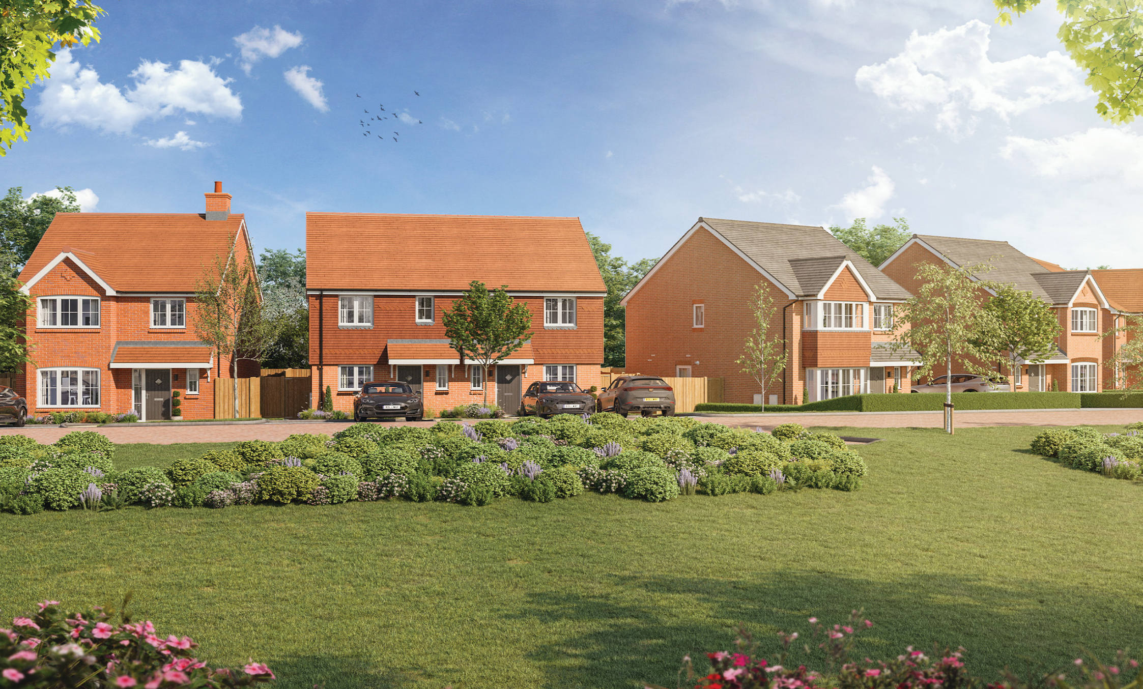
The Tailor Woodbury Manor, Hailsham BN27 2SH