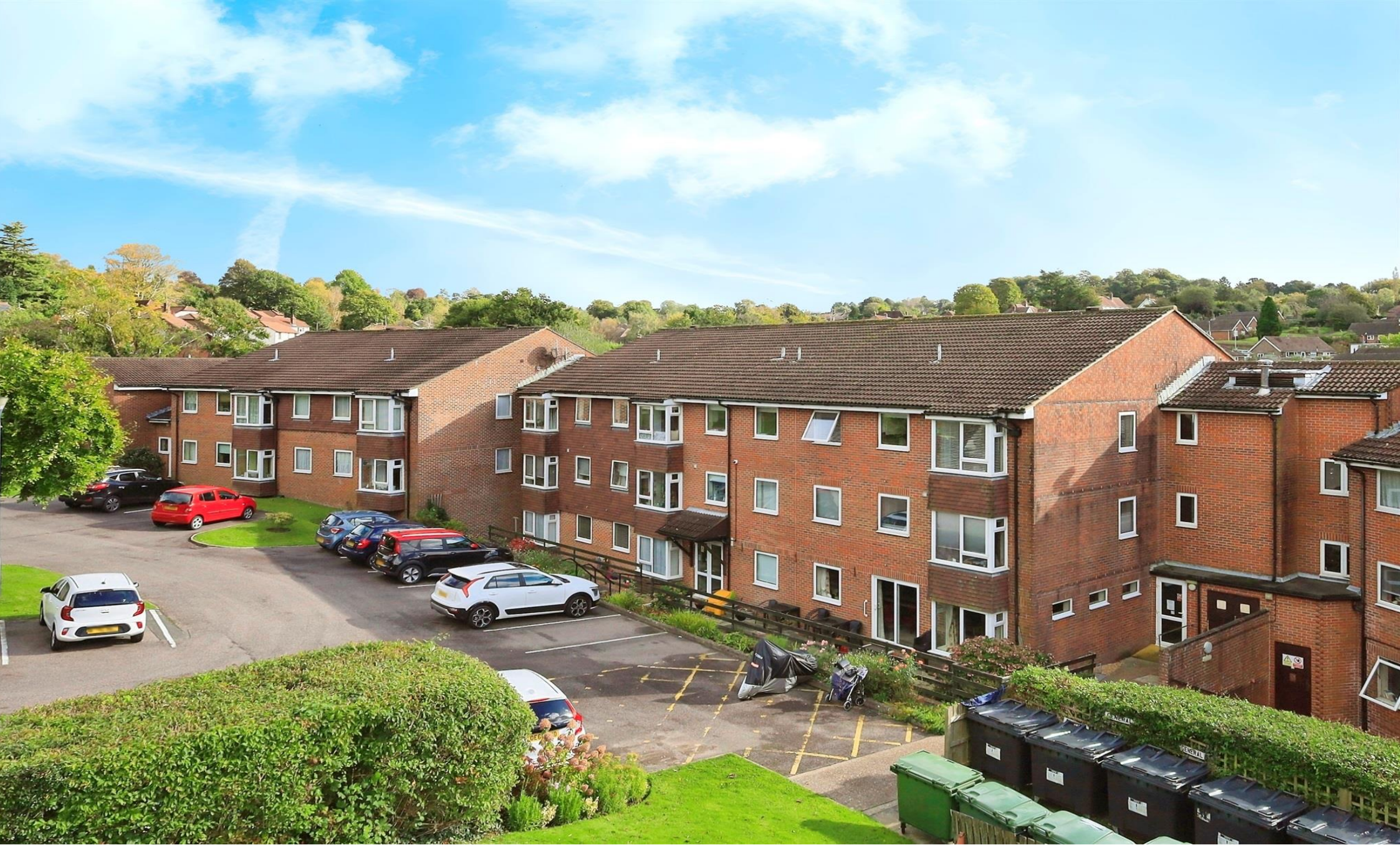
Davenport Park, Station Road, Heathfield TN21 8LE