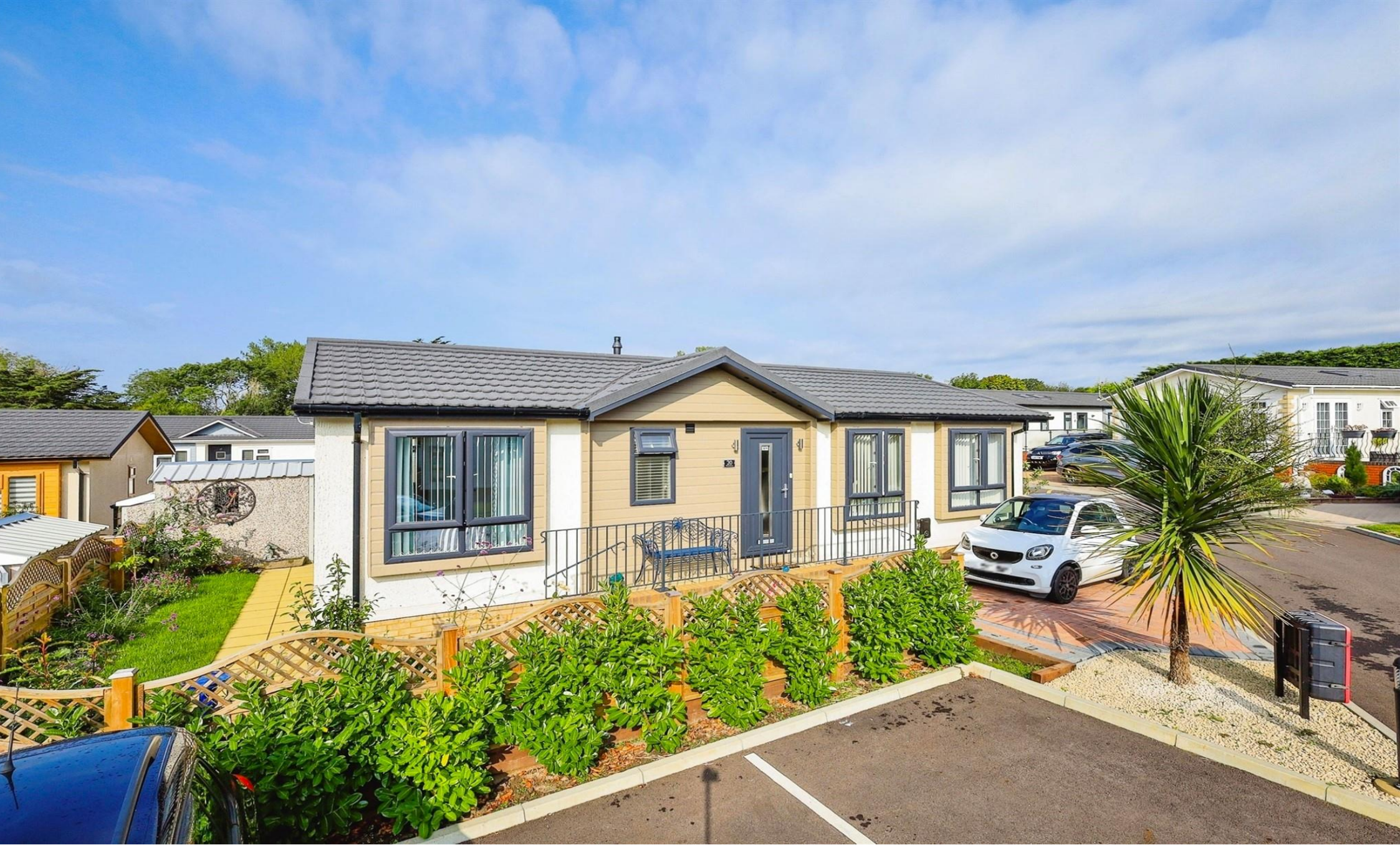
Woodland View Residential Park, Horebeech Lane, Horam, Heathfield TN21 0GH