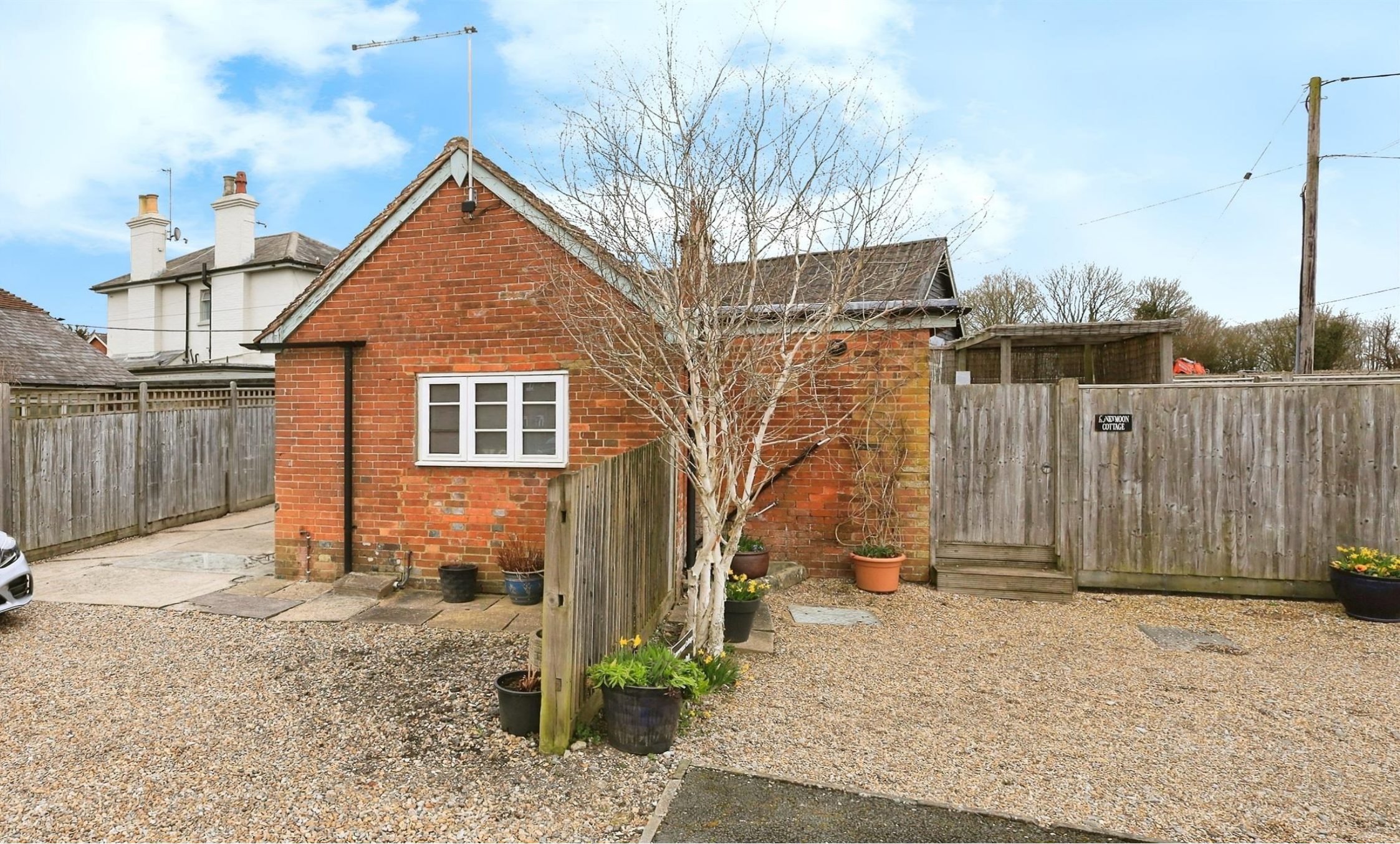
Honeymoon Cottages, Golden Cross, Hailsham BN27 4AW