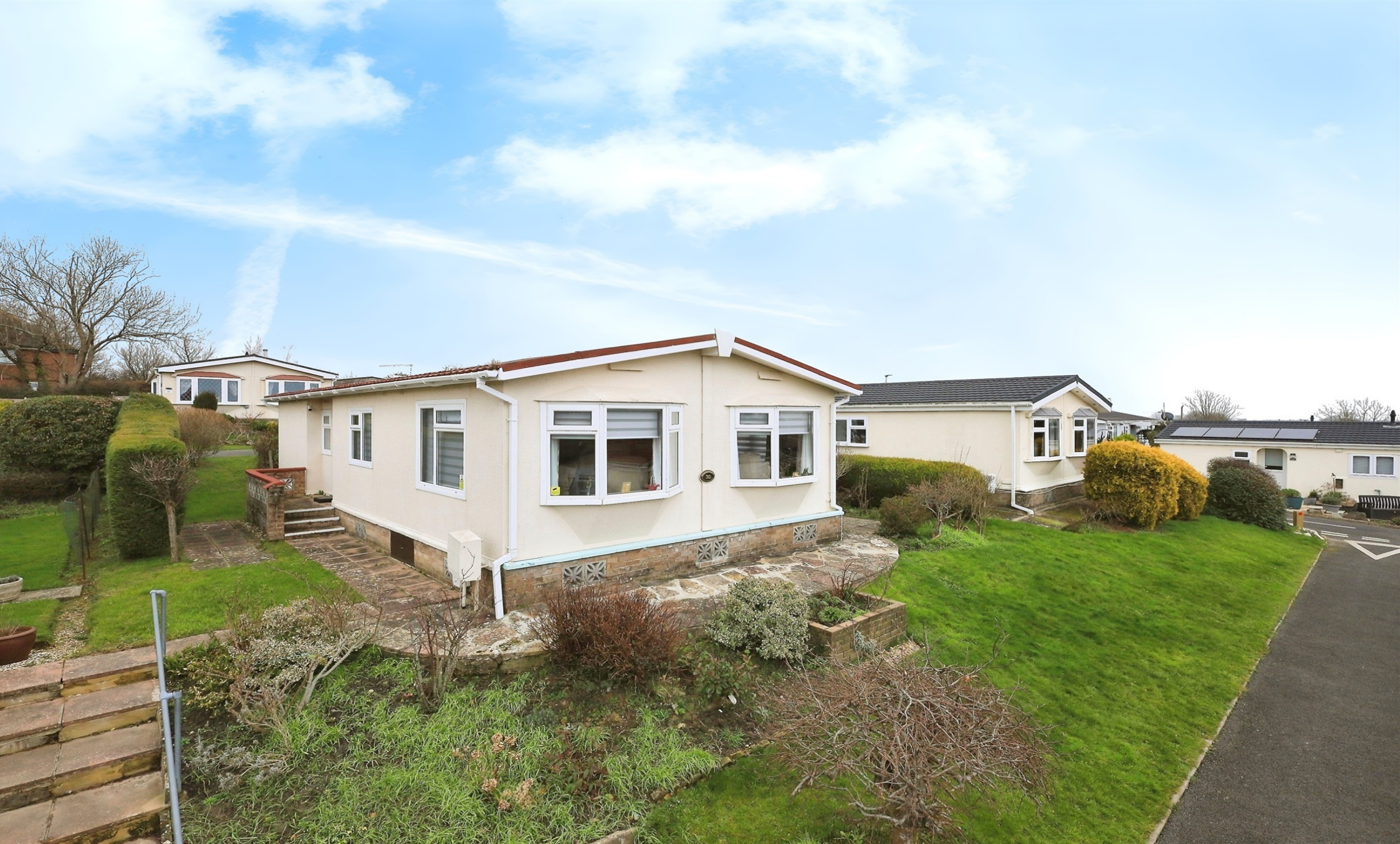
Lion House Park Mill Road, Hailsham BN27 2SQ