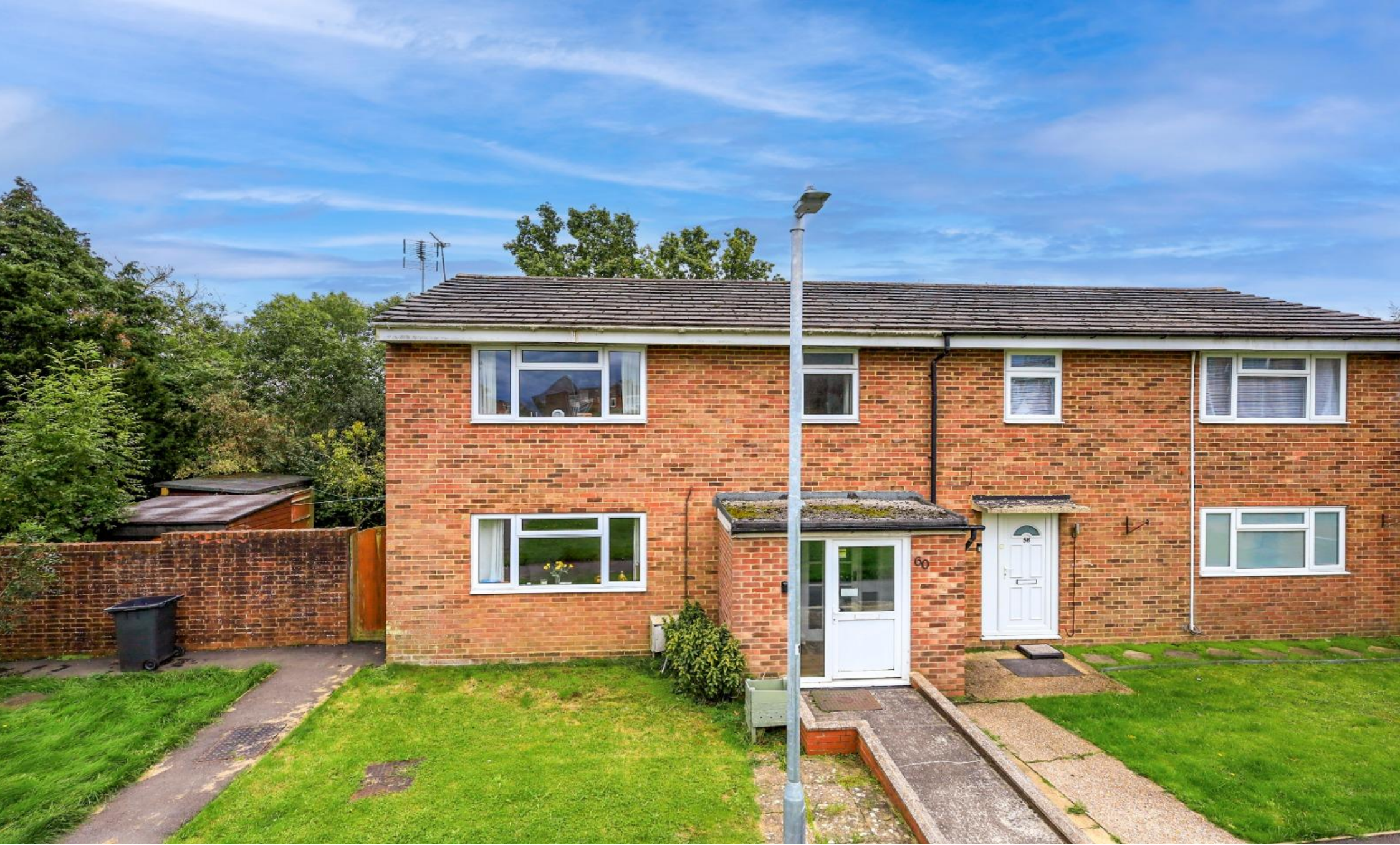
Merlin Court, Observatory View, Hailsham BN27 2PS