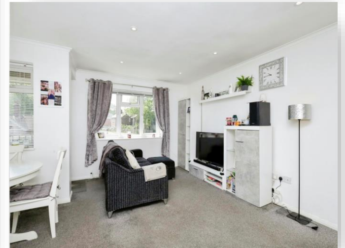
Beauford Road, Horam, Heathfield TN21 0EB