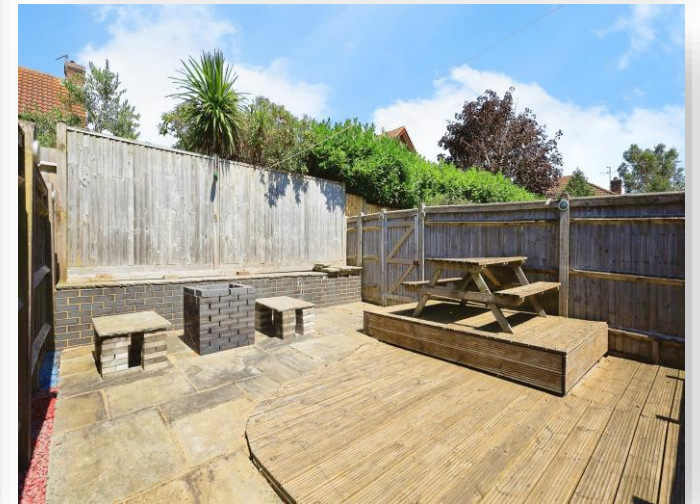
Sussex Close, Hailsham BN27 3EB