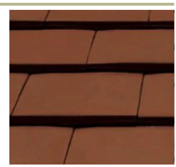
Sandtoft Clay Roof Tile Natural Red