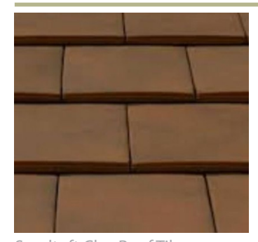
Sandtoft Clay Roof Tile Flanders