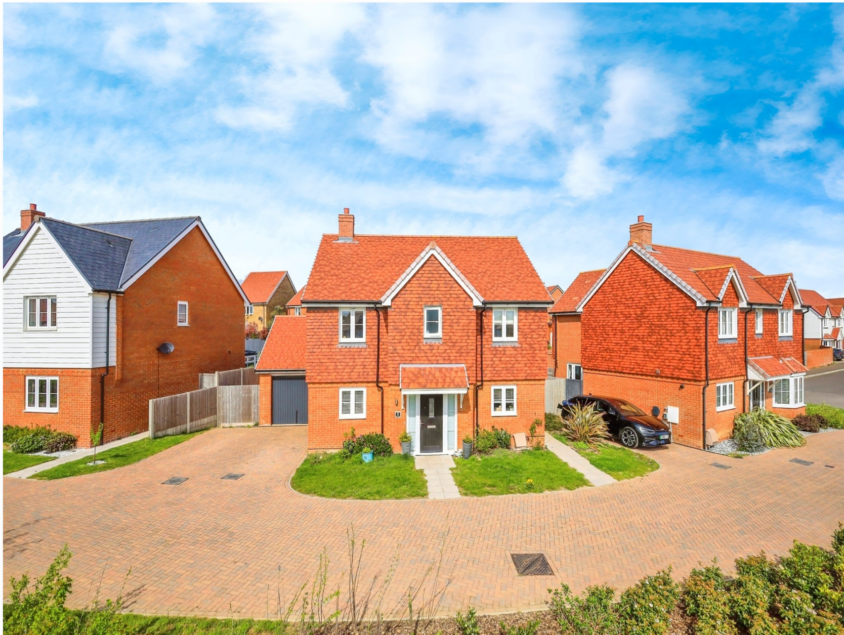
Bluebell Rise, Hellingly Hailsham BN27 4FL