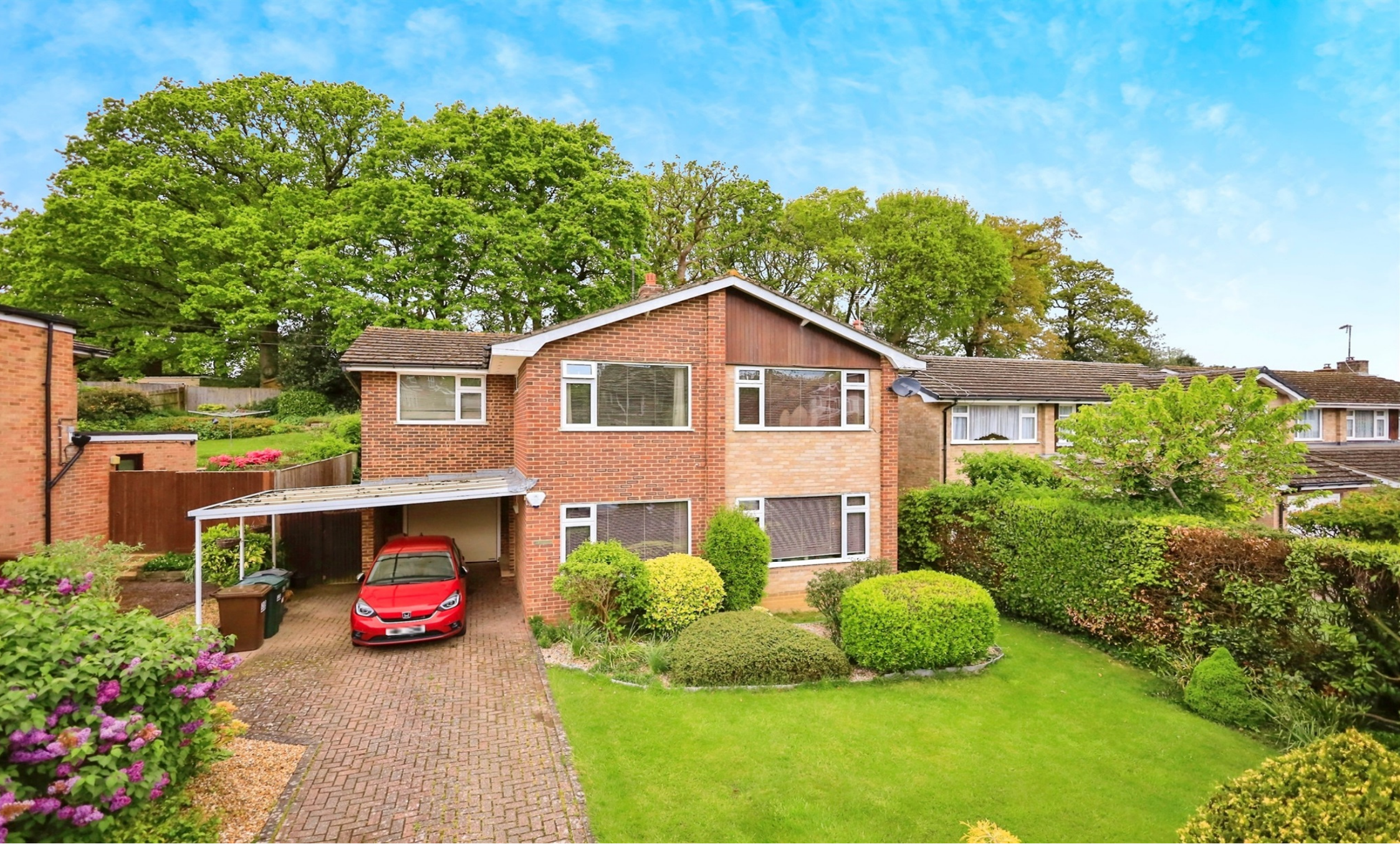
Woodlands Close, Hailsham BN27 1ET