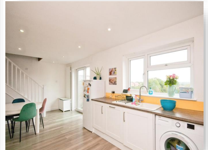
Battle Crescent, Hailsham BN27 1EW