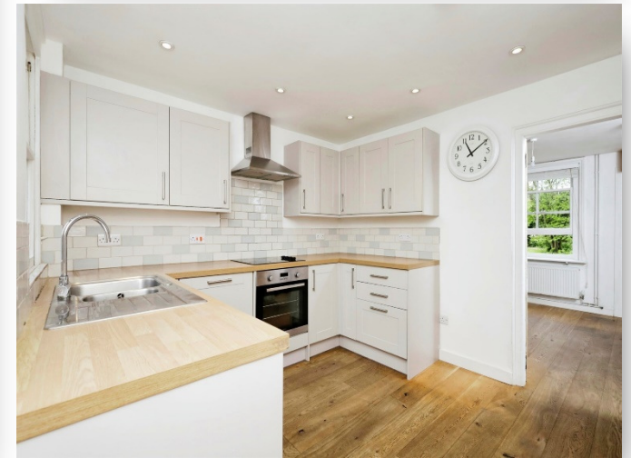
Thunders Hill Cottages Thunders Hill, Golden Cross Chiddingly BN27 4AE