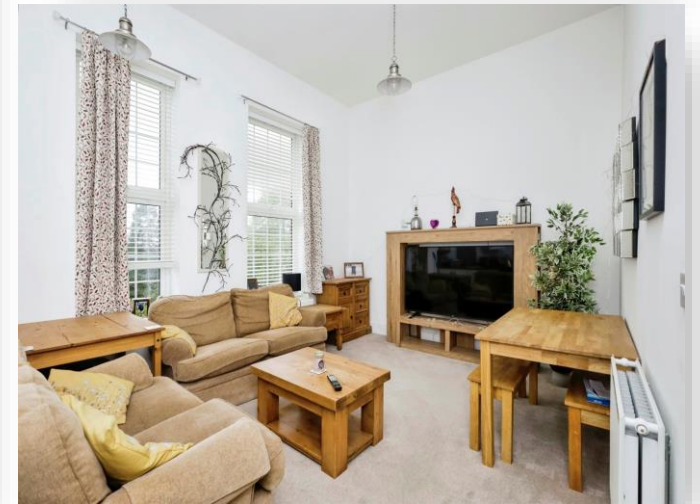
Bradley Drive, Hellingly Hailsham BN27 4DF