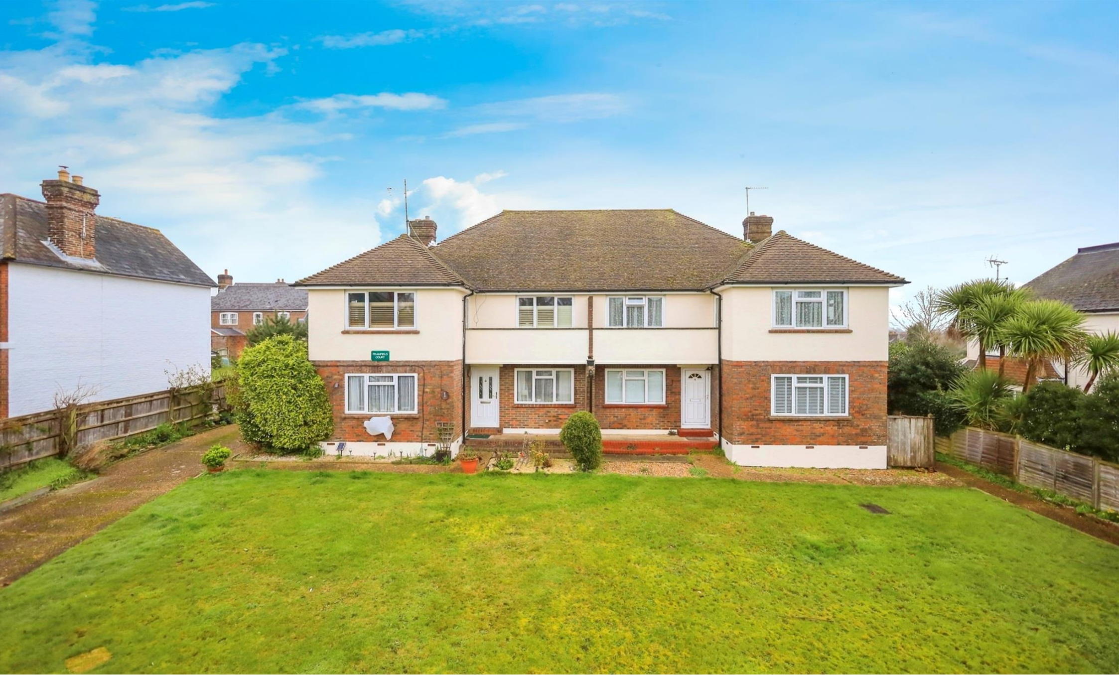
Framfield Court Framfield Road, UCKFIELD TN22 5AQ