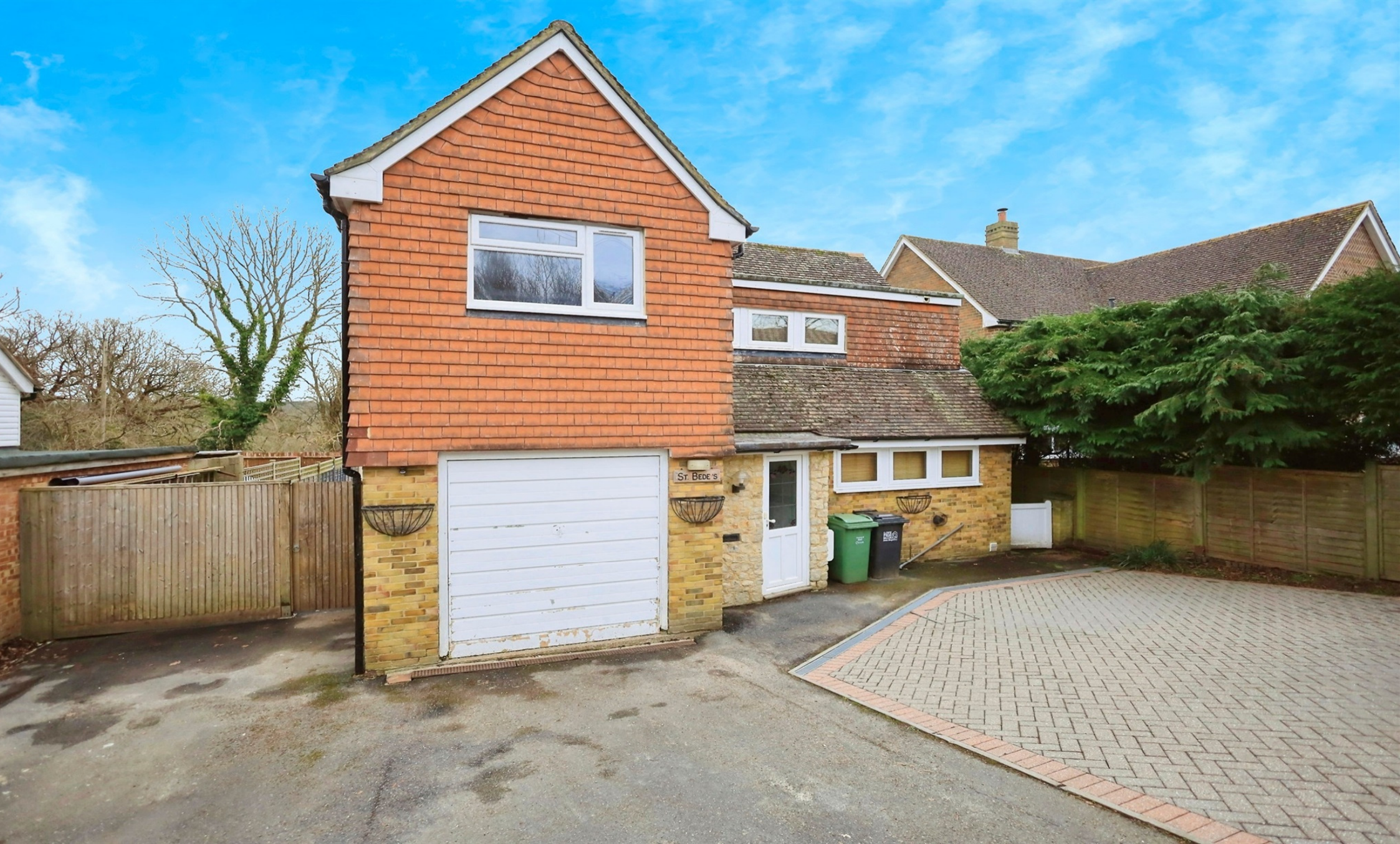
St Bedes Burgh Hill, Etchingam TN19 7PE