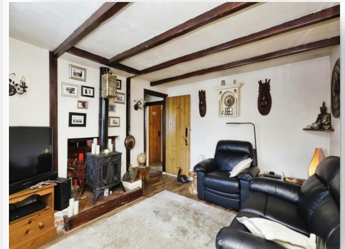
Battle Road, Hailsham BN27 1UE