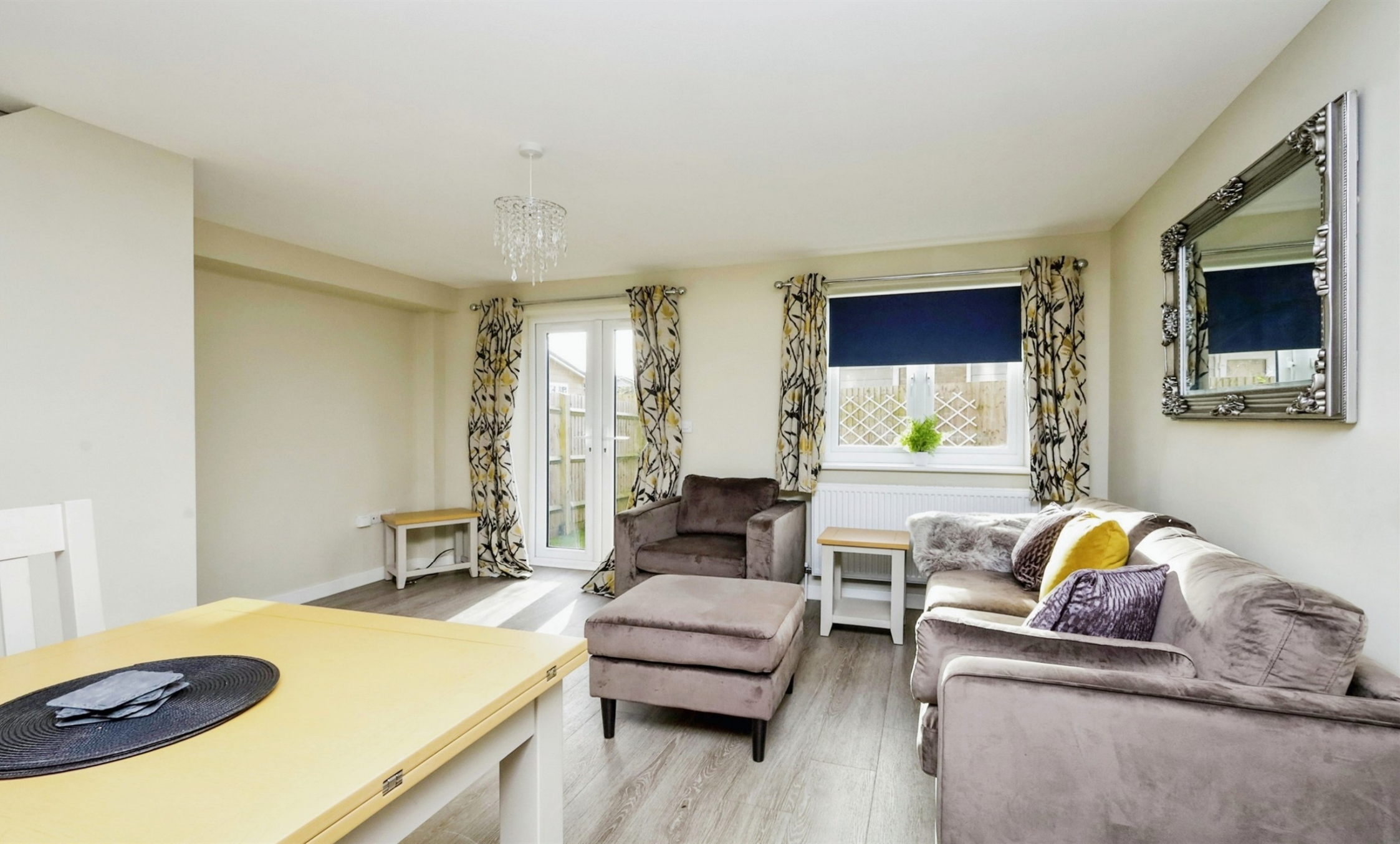
Garden Cottages Golden Cross, Hailsham BN27 4AW