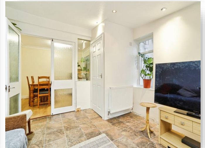
Parkstone Grove, Leeds LS16 6EX