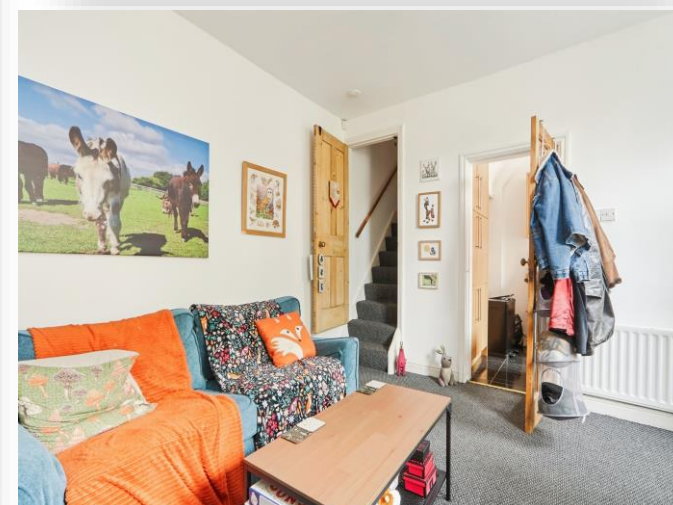
Woodville Crescent, Horsforth Leeds LS18 5DQ