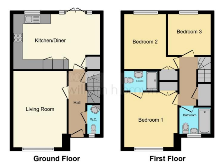
This floor plan is for illustrative purposes only. It is not drawn to scale. Any measurements, floor areas (including any total floor area), openings and orientation are approximate. No details are guaranteed, they cannot be relied upon for any purpose and they do not form part of any agreement. No lability is taken for any error, omission or misstatement. A party must rely upon its own inspection(s). Powered by www.focalagent.com