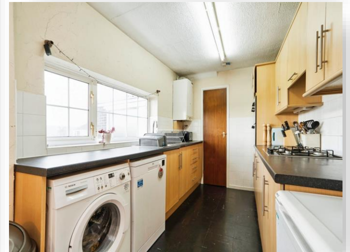
Vesper Lane, Leeds LS5 3NR