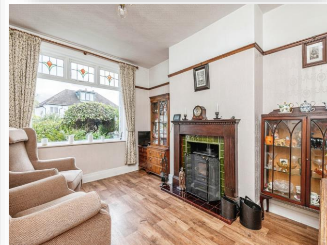
Victoria Drive, Horsforth Leeds LS18 4PN