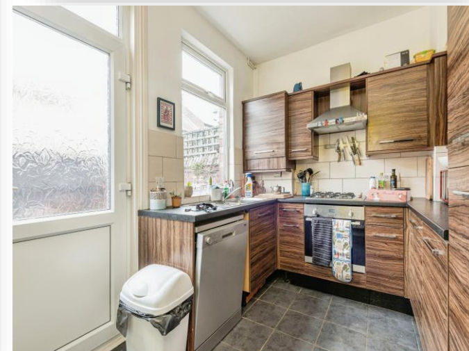
Rose Avenue, Horsforth Leeds LS18 4QE