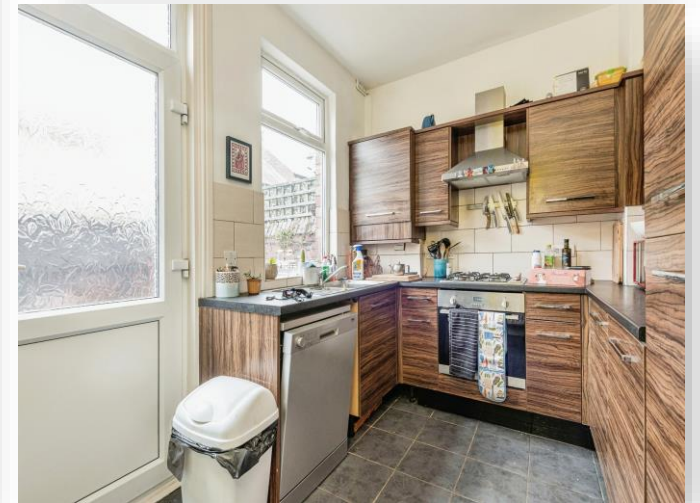
Rose Avenue, Horsforth Leeds LS18 4QE