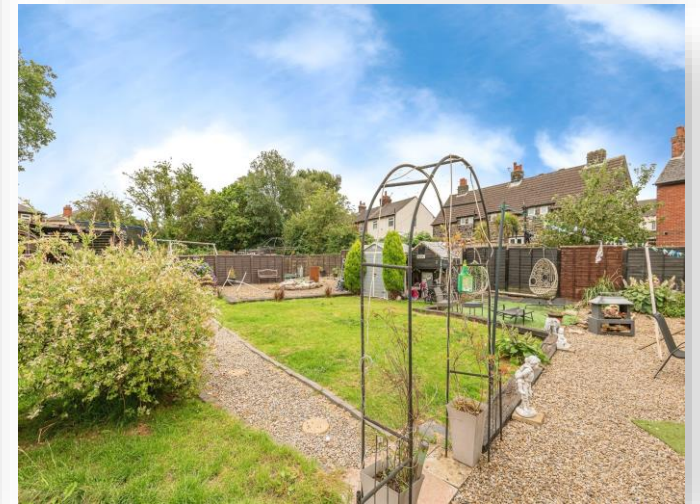
Cragside Gardens, LEEDS LS5 3LS