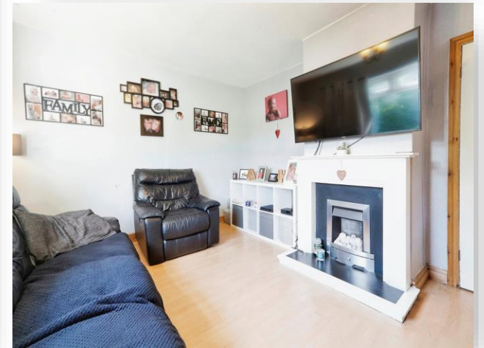
Silk Mill Road, Leeds LS16 6PT