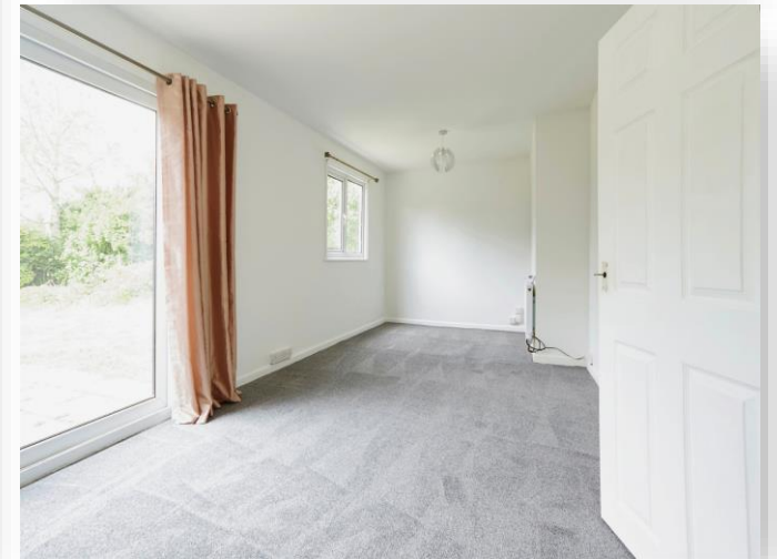
Bedford Mount, Leeds LS16 6DP