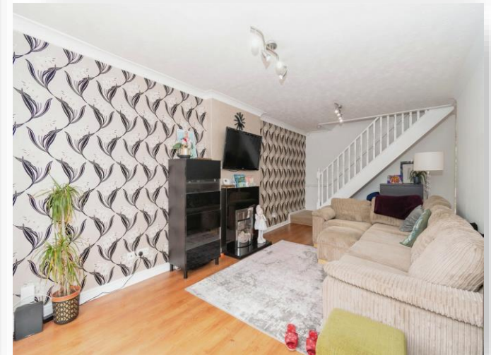
Haven Chase, Leeds LS16 6SG