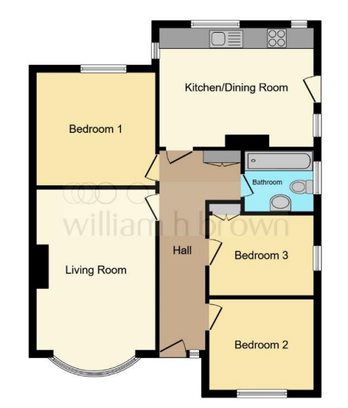
This floor plan is for illustrative purposes only. It is not drawn to scale. Any measurements, floor areas (nocluding any total floor area), openings and orientation are approximate. No details are guaranteed, they cannot be relied upon for any purpose and they do not form part of any agreement. No liability is taken for any error, omission or misstatement. A party must rely upon its own inspection(s). Powered by www.focalagent.com