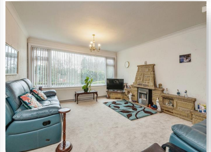
Hall Lane, Horsforth Leeds LS18 5JF