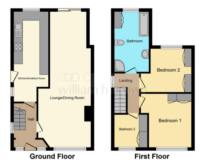
This floorplan is for illustrative purposes only and is not drawn to scale. Measurements, floor-areas, openings and orientations are approximate. They should not be relied upon for any purpose and do not form any part of an agreement. No liability is taken for any error or mis-statement. All parties must rely on their own inspections.