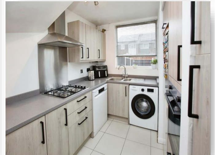
Prideaux-Brune Avenue, Gosport PO13 0PP