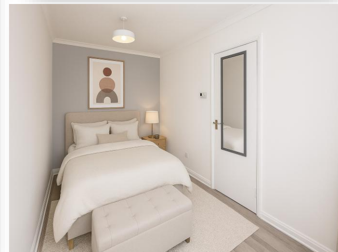
Hove Court, High Street, Lee-On-The-Solent, PO13 9DR