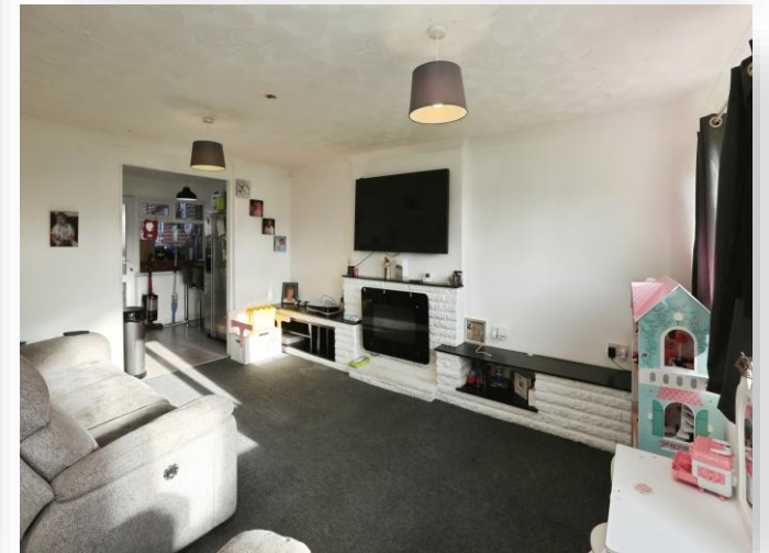
Lawn Close, Gosport PO13 0BZ