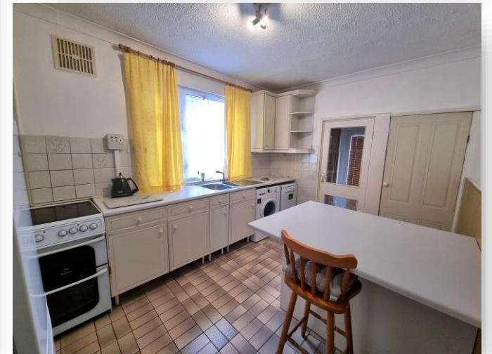
Mortimore Road, Gosport, PO12 3BJ