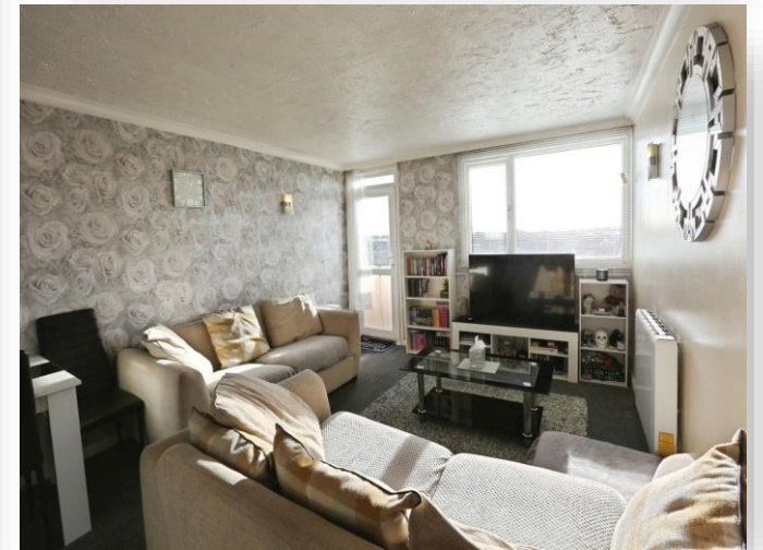
Cornwell Close, Gosport, PO13 9QN