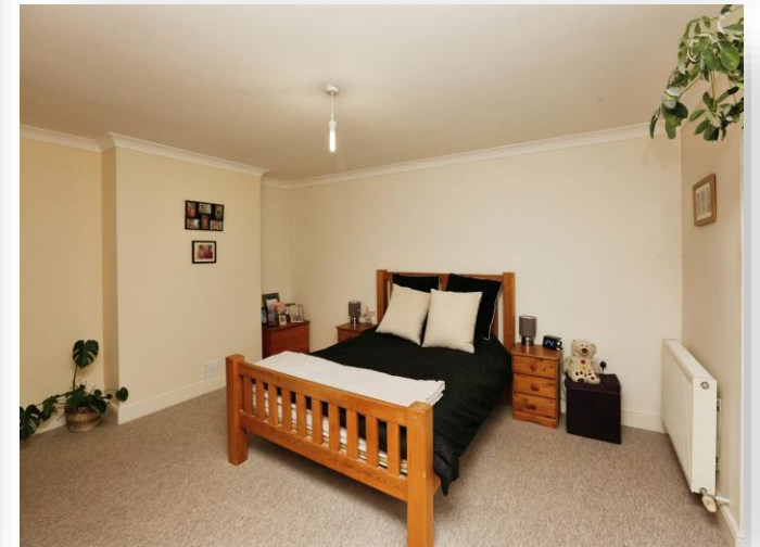
Wheatsheaf Mews, Brockhurst Road, Gosport, PO12 3AZ