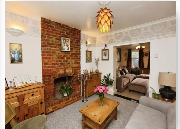
Pump Lane, Gosport, PO13 0HJ