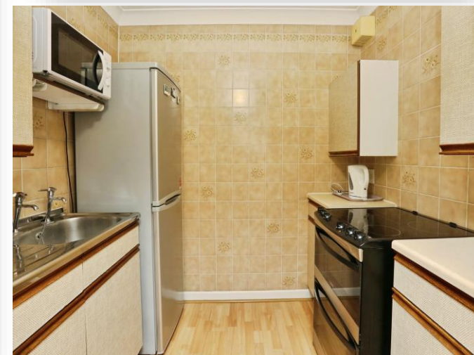
Homefort House, Stoke Road, Gosport, PO12 1QG