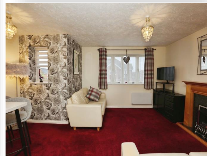
Hermes Court, GOSPORT PO12 4LD