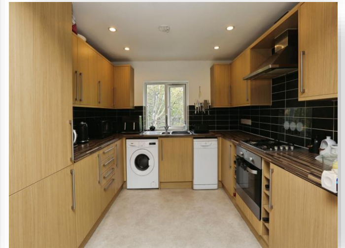
Filmer Close, Gosport, PO13 9SD