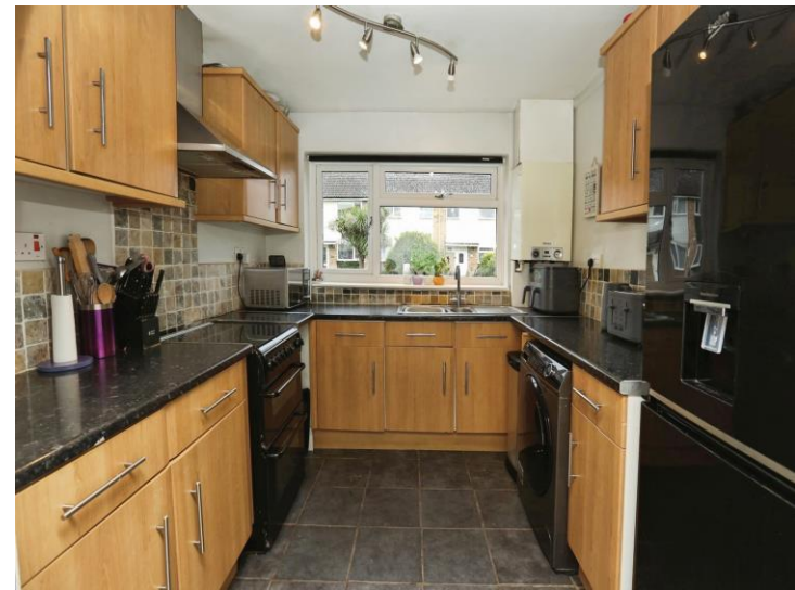
Hanbidge Crescent, Gosport PO13 0YD