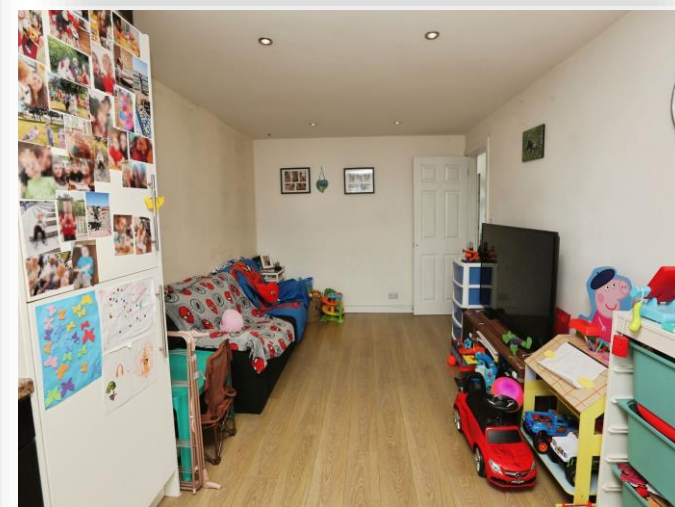
Mill Lane, Gosport, PO12 4QG